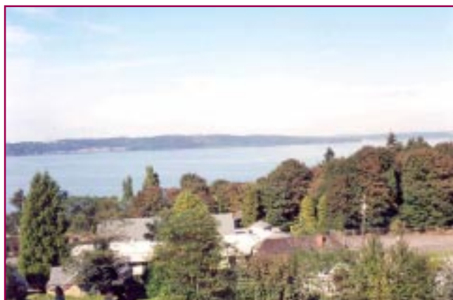
...the view is a bonus for the women to experience tranquility in its natural state.

1819 Austin Rd. N.E. Tacoma, 98422 253-927-3560