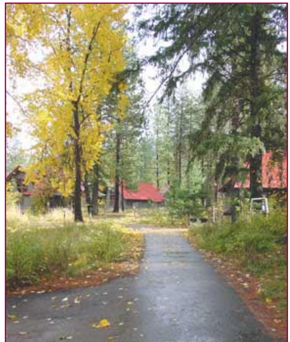
Enjoy Nature Around You as You Stroll the Many Paths