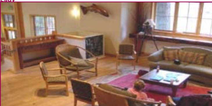
Quiet Areas to Relax and Read can be Found Thru Out Sleeping Lady