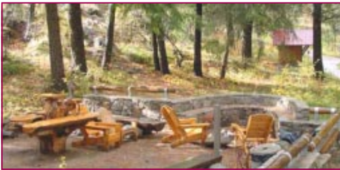
Rustic Outdoor Fire Circle and Meeting Place at Sleeping Lady