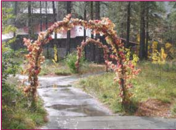
Arches of Fall Leaves Lead You to Your Destination

The Beauty of Sleeping Lady (Natural and Artistic)