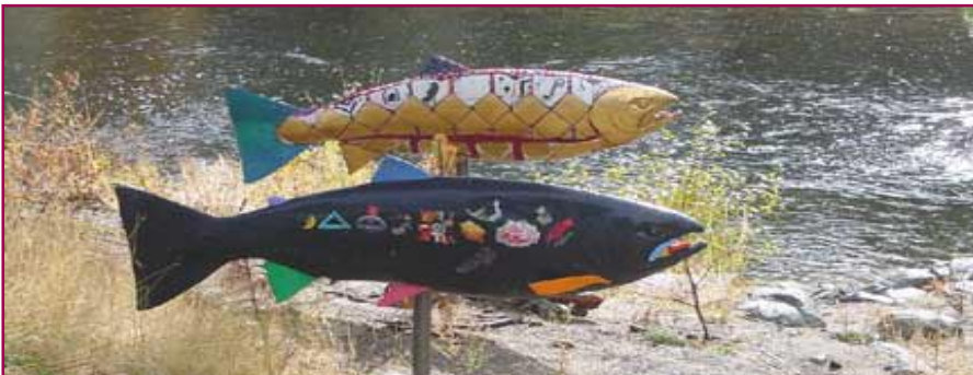
There are Several Different Painted Salmon to View in During a Stroll by the River