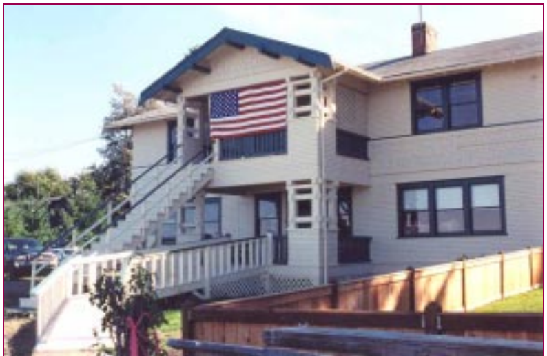
Together Care shows its Pride

Together Care is a program for pregnant and parenting mothers who suffer from the disease of chemical dependency. Our mission is to work towards the reunification of families within our community and to gain support through local resources to ensure success for their futures. The focus is to help women have a safe and productive treatment experience that can translate into better outcomes. Together Care helps women deal with the lingering issues of domestic violence, co-dependency, parenting, navigating support systems that develop ongoing recovery skills.