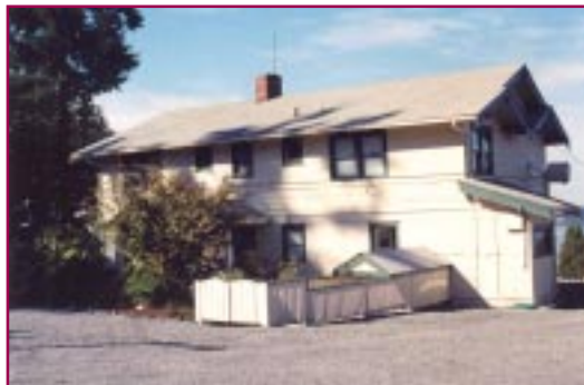
Together Care-back side