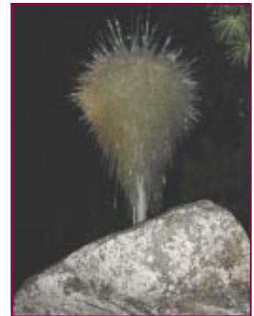
Chihuly's Beautiful Outdoor Glass Sculpture lighted at Night