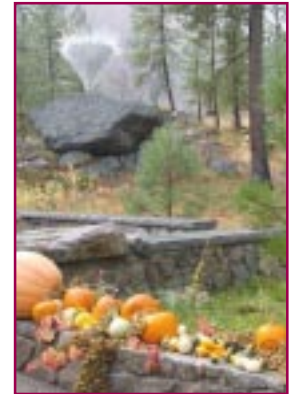
Chihuly's Fountain by Daylight