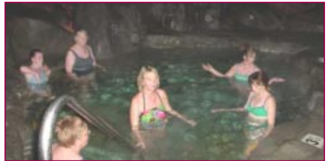
Relax in the Natural Hot Tub Surrounded by a Rock Wall